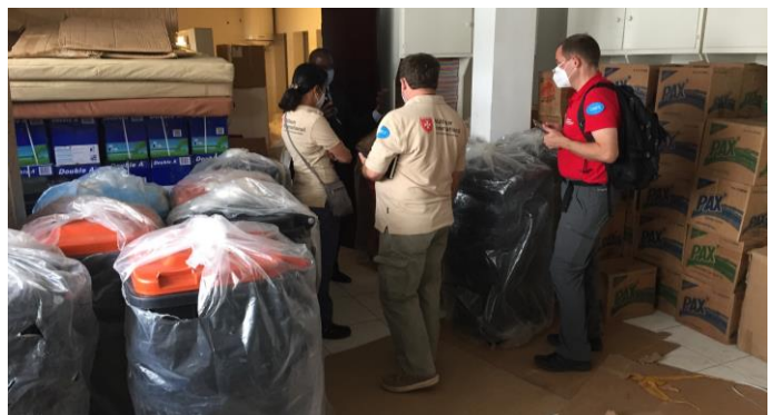
Malteser International EMT assessment in Mbappe Stadium Cameroon

A second team rotation from Malteser has arrived in Cameroon as well as ISAR Germany which continues on its third week supporting Armenia