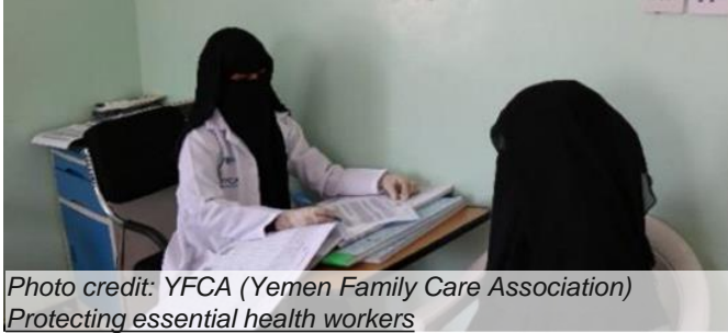
Protecting essential health workers

The The Global Health Cluster COVID-19 Task Team established four peer groups to develop tools and key messages on the following topics: gender-based violence and health, case management, prioritization of essential health services and an ethical framework for humanitarian settings. To further inform the work of the Task Team a survey will be administered to all partners and Health Clusters to identify operational challenges