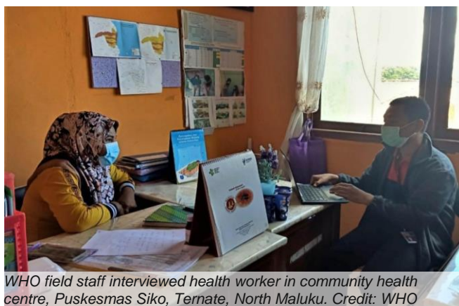
WHO field staff interviewed health worker in community health centre, Puskesmas Siko, Ternate, North Maluku.

The participants highlighted the urgent need to establish a coordination platform to provide MHPSS at subnational level and further engage community health centres (puskesmas), community health posts (posyandu), youth organizations and religious associations to reach those in need of support.