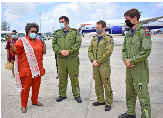
Prime Minister Mia Amor Mottley chatting with members of the Canadian Armed Forces following their arrival at the Grantley Adams International Airport to deliver COVID-19 essential medical supplies for CARICOM countries.

“In today’s world, many people repudiate multilateralism and cooperation. But we stand here today as a result of our commitment that by working together in partnership, through the institutions that have been established so to do, and also across institutions and across sovereign states, that partnership has made the difference for our ability to respond to what would come to be regarded as the most significant disruption of global society and the global economy in ... probably a century” –