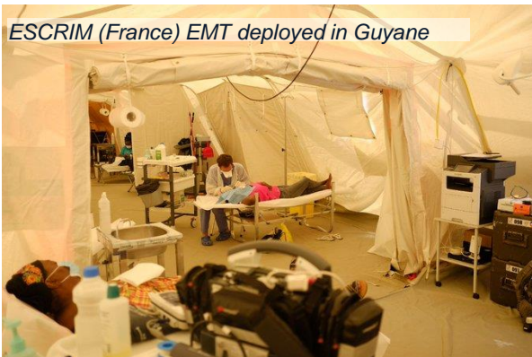
ESCRIM (France) EMT deployed in Guyane

The EMT network is currently preparing for the deployment of experts and teams to the Occupied Palestinian Territory and Papua New Guinea to support the Ministries of Health in their response to the increasing cases of COVID-19.